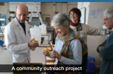
A community outreach project