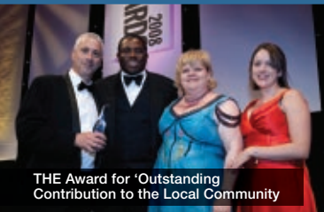
THE Award for 'Outstanding Contribution to the Local Community'