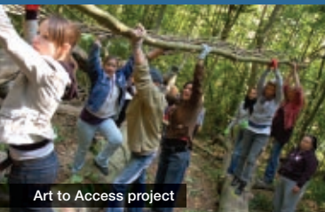
Art to Access project